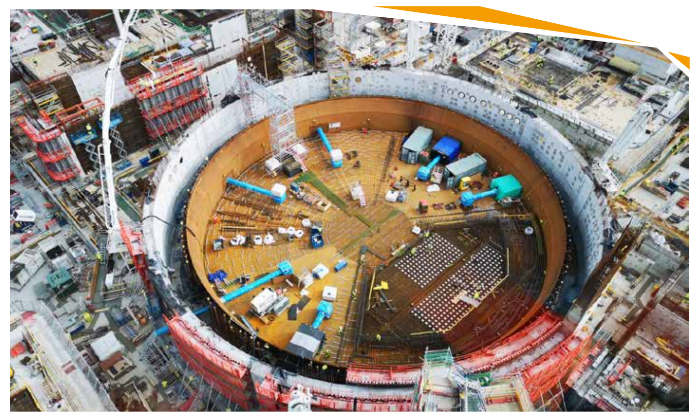
Unit 1 with liner cup and sump suction lines installed.

An exciting innovation on the project is the new Mesh Factory, which can produce up to 1,000m<sup>2</sup> of reinforcement mesh per day. The factory's tying gantry comprises five individual robots that have been programmed especially to perform tying within the factory, each fitted with a replaceable tying gun attachment to bind mesh together. As well as increasing productivity, this innovation will reduce the amount of manual handling for our Steel Fixers and the risk of associated injuries.